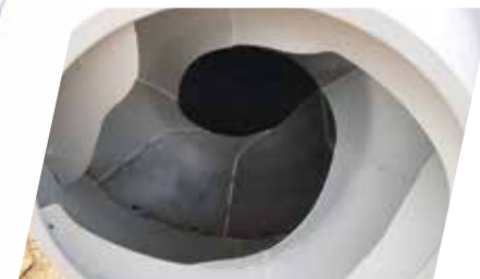
The fin design is form-pressed throughout the entire drum for an accurate spiral and faster discharge.