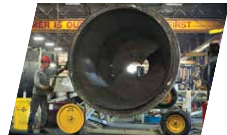
The legendary McNeilus drum is made for long life and maximum payload.